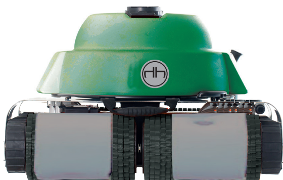
Robot M width 75 cm